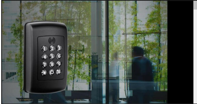
KEYINCODE WALL READER KIC5500-WR KEYINCODE: 978-207-0269