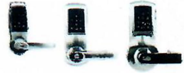
Lock or Locks